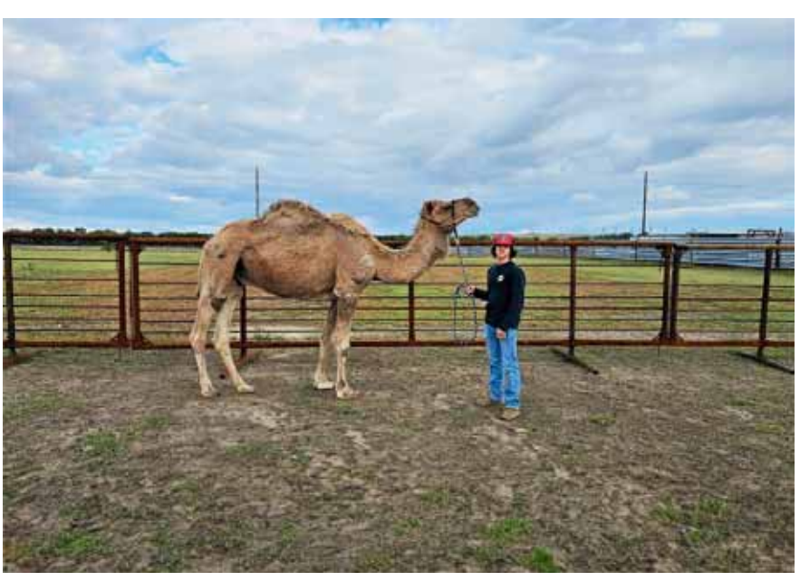
In stock, shipping available!